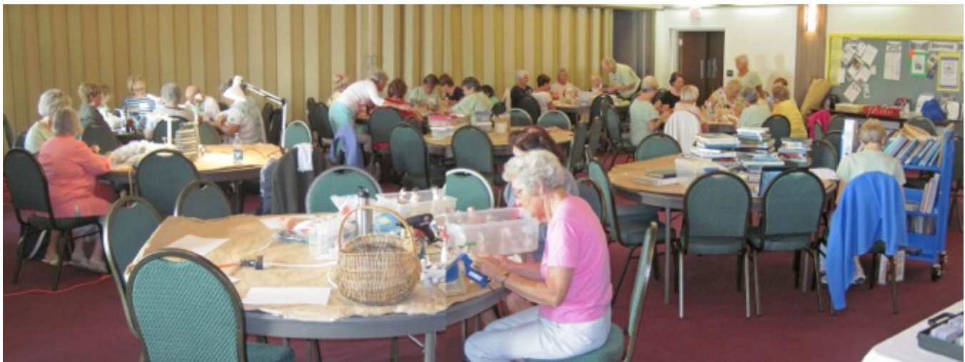
First workshop was a great success