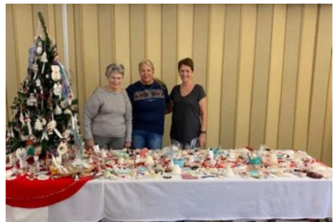
Holiday Sale 12-7-19