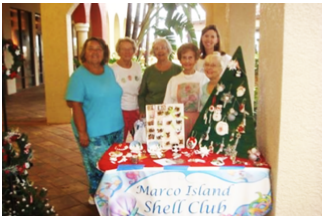
Holiday Sale 12-15-09

It is an amazing experience to work with a room full of members so focused on keeping our club relevant and successful.